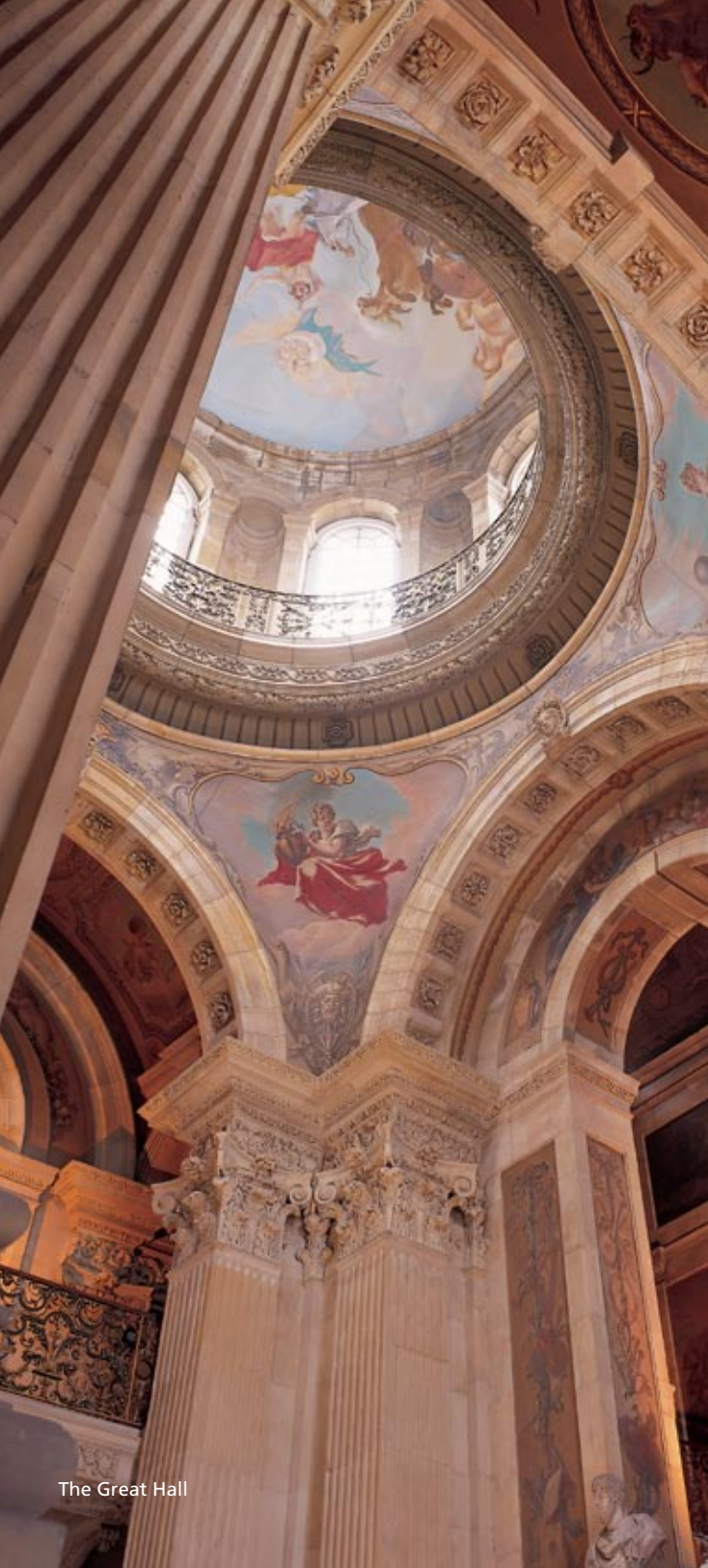
The Great Hall