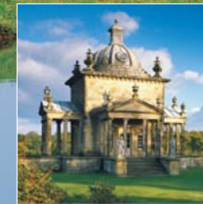
The Temple of the Four Winds