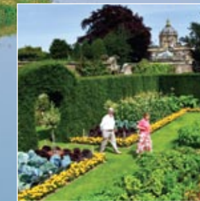
The Walled Garden