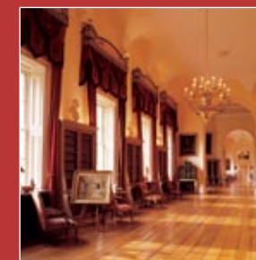
The Long Gallery