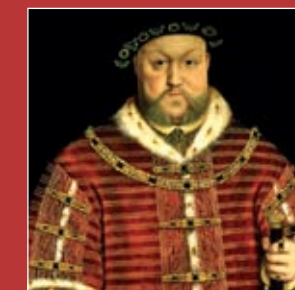
The Picture Collection