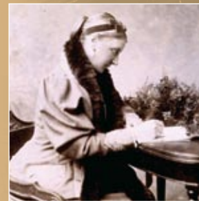
Maids & Mistresses