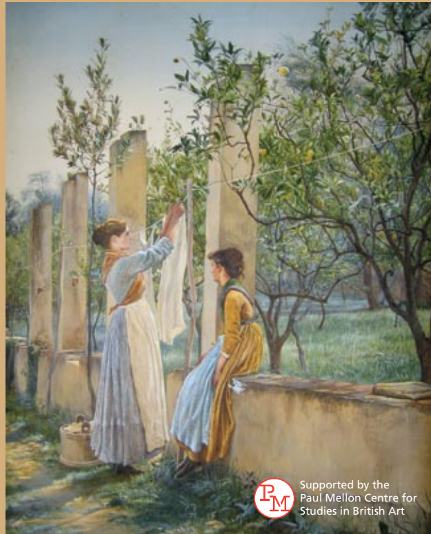
A Lemon Garden at San Remo, 1875, by George Howard (1843-1911)

His life and work was influenced by his close relationships with key figures in the Pre-Raphaelite movement, most especially William Morris and Edward Burne-Jones. On display is a rich selection of his paintings – many of them never seen in public before – together with examples of his sketchbooks and correspondence drawn from private archives.