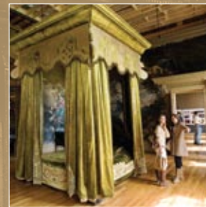
The High South

Breathtaking, awe-inspiring and sublime are amongst the most widely used words to describe Castle Howard's grounds. With its statues, temples, lakes and fountains, the magnificent landscape perfectly echoes the grandeur of the house.